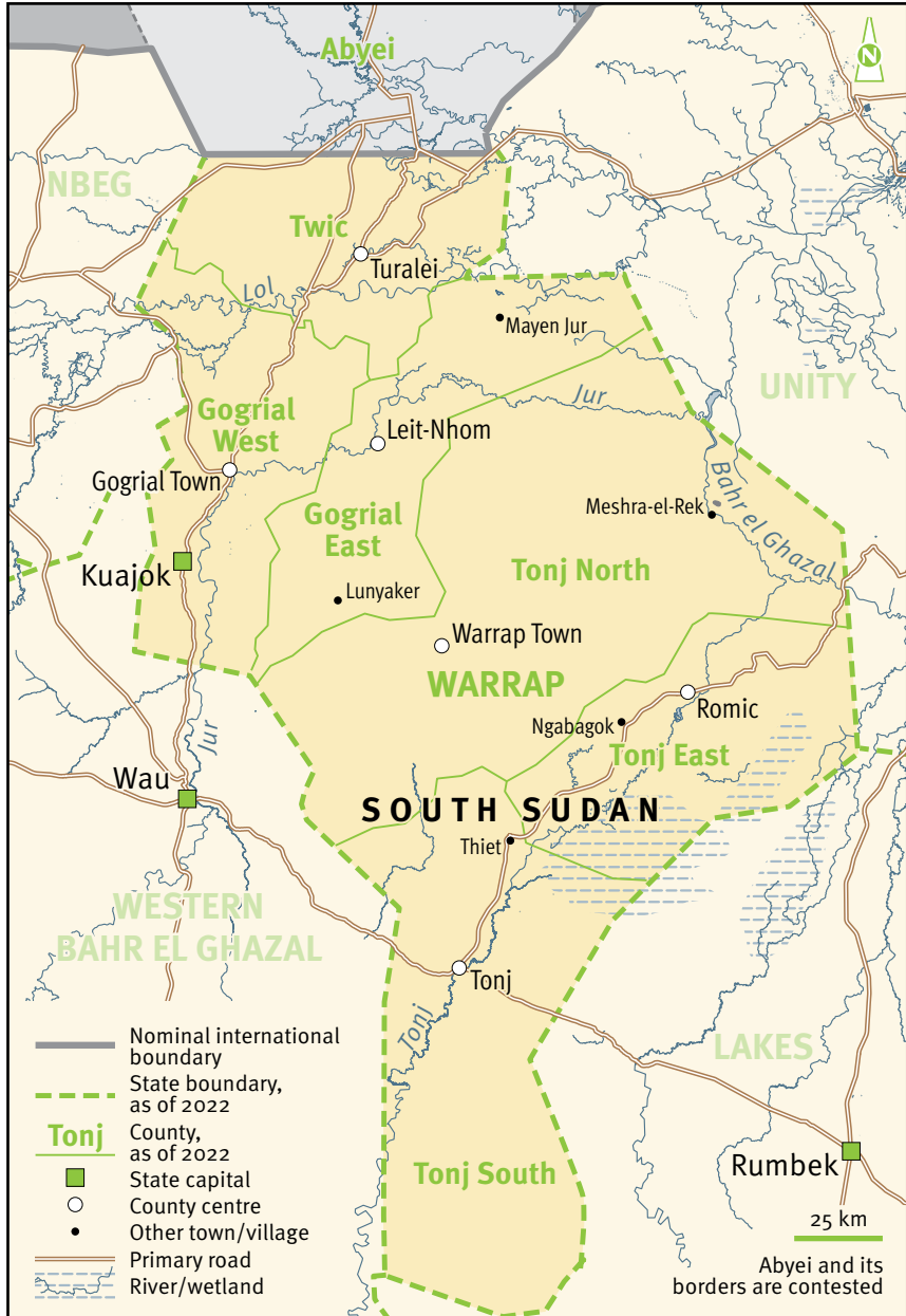
Map 1 Warrap state